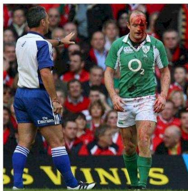
Hickie: If I can get off, get my head stitched up, stop it from bleeding, change all my gear and find another scrum cap in the next ten minutes then they'll let me back out to play.